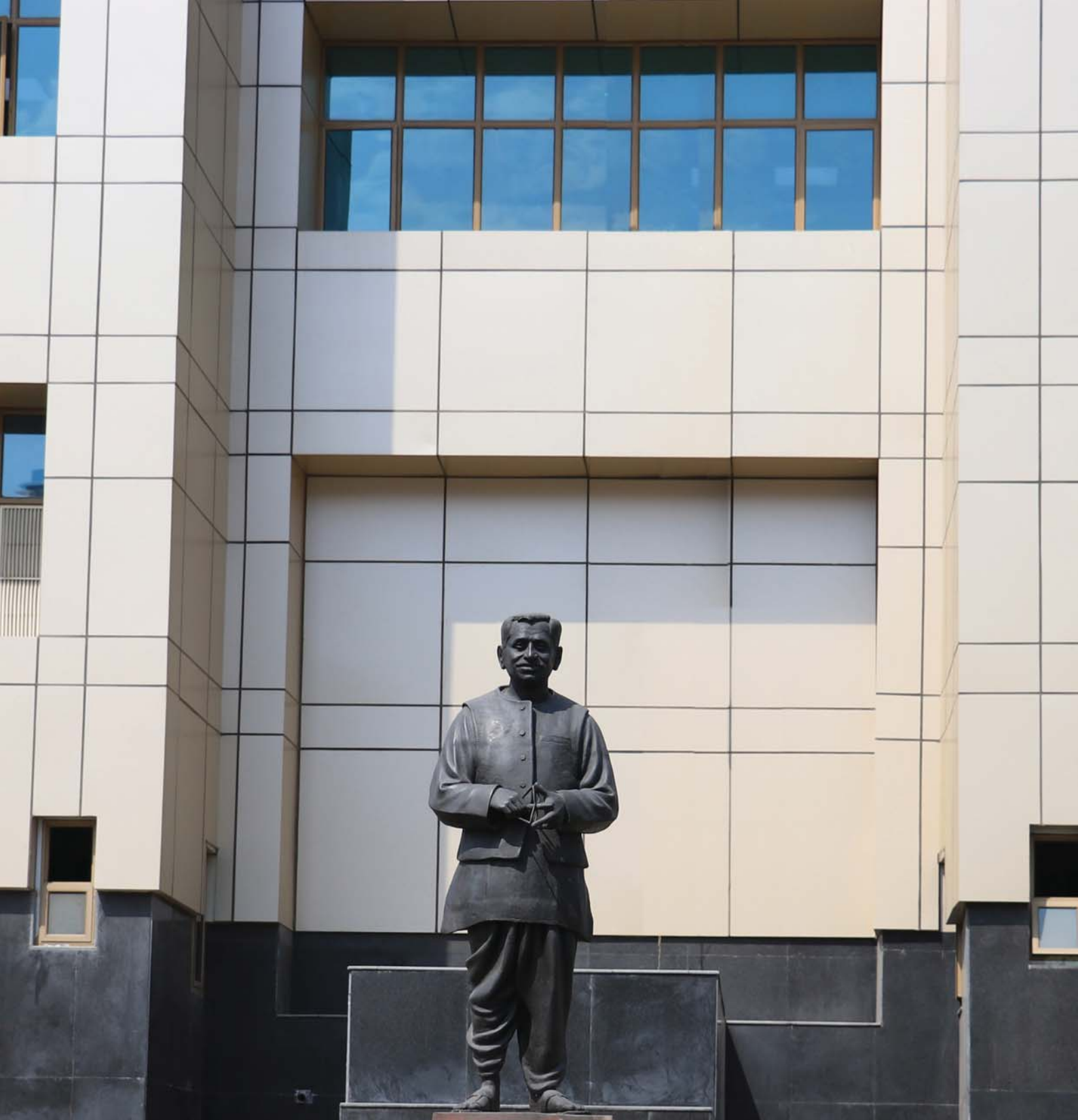
Pt. Deen Dayal Upadhyaya Ji A Man of Principles